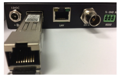
2. Position the SFP Module in front of the SFP socket